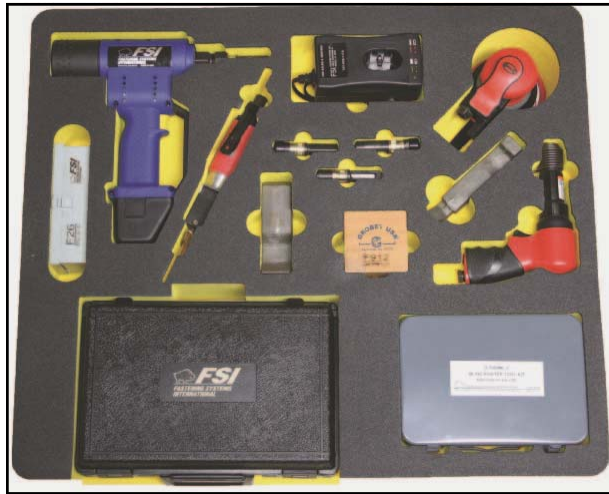
Installation Tools & Riveter Kits - Tray # 5

P.O. Box 1372 1206 E. MacArthur St. Sonoma, CA 95476 1-800-344-2393 (707) 935-1170 FAX: (707) 935-1828 CAGE Code: 64878 www.fsirivet.com Email: sales@fsirivet.com